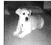
Boomer Carpenter 12/15/95- 03/26/11