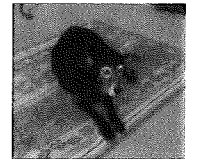
Whirlie Webb April 1996 03/25/11