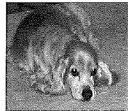
Rusty Burrus 5/26/99- 4/17/10