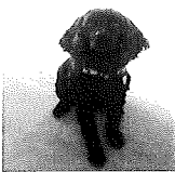
Samantha Perry 10/16/2000- 7/9/2011