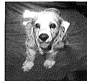
Samson Carpenter 1999- 3/10/11