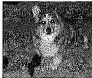
Parker Savell June 2011